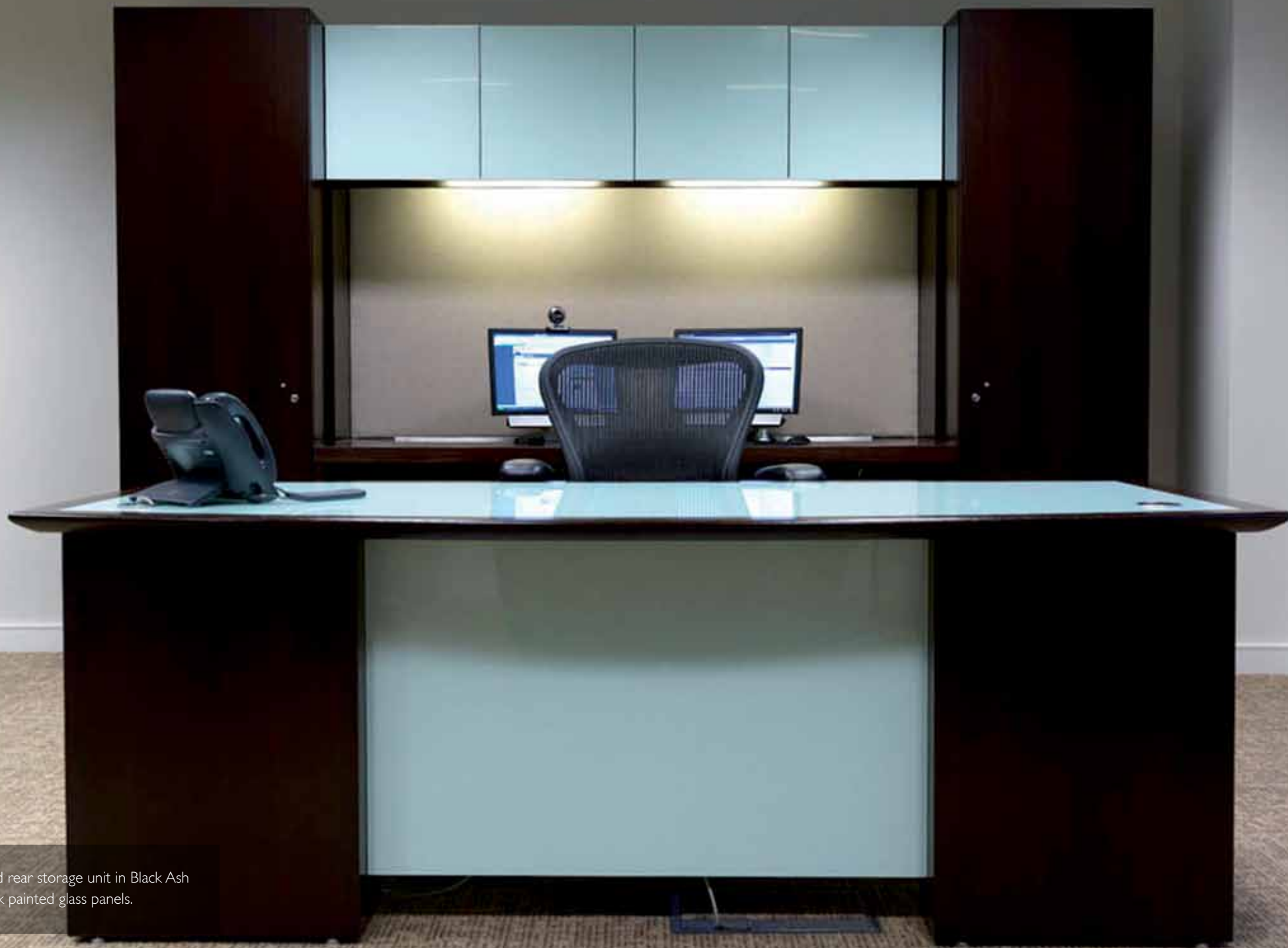
Desk and rear storage unit in Black Ash with back painted glass panels.